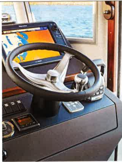
A tournament-style wheel with knob eases quick maneuvers at high speeds.

Sea conditions were flat calm, but we found a wake or two to play with, and managed to get the boat airborne crossing one at 32 knots. Pulling the throttles back to idle gently settled the boat into displacement mode. Close-quarters maneuverability is fantastic with the powerful bow thruster and stern drive.